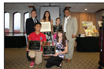
2012 winners with NMABE and Santillana representatives.